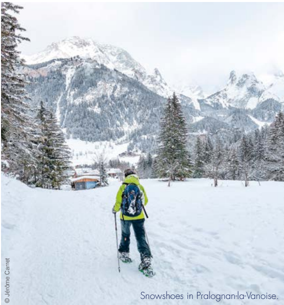
Snowshoes in Pralognan-la-Vanoise.